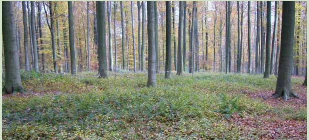
A beech forest near Leuven, Belgium.

The EUFORGEN Steering Committee will have its seventh meeting in Vienna, Austria on 16-17 September 2010, to develop a detailed workplan for the next two years. The meeting was originally scheduled for April 2010 but had to be postponed due to the flight problems caused by the volcanic ash clouds across Europe. Further information on Phase IV is available on the EUFORGEN website ( www.euforgen.org ).