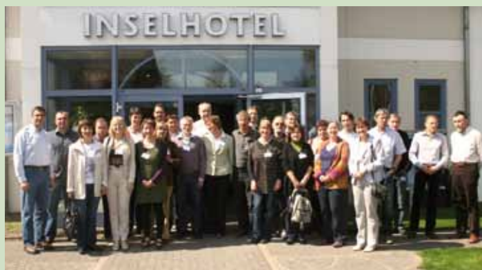
Tenth Forages Working Group meeting participants.

Overall, the WG meeting was very fruitful due to the excellent local arrangements and also to the active participation of WG members. Inputs from ECPGR thematic Networks and on-going research projects provided cross-fertilization for the future activities in the Working Group.