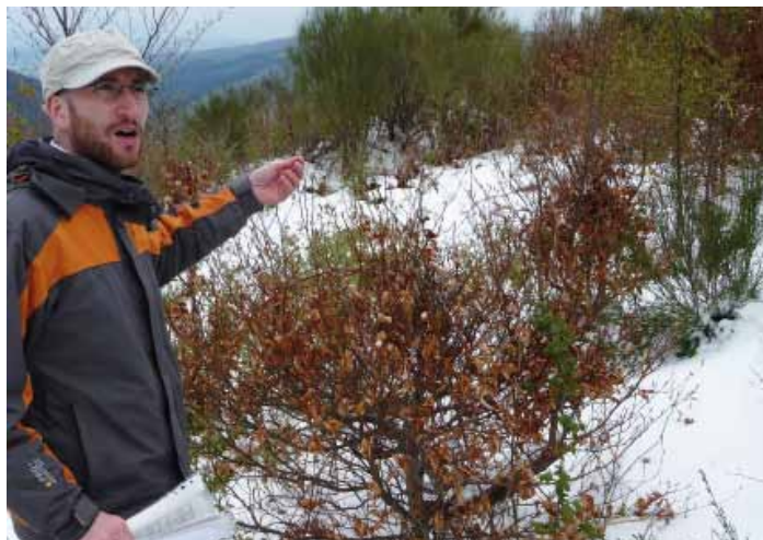
Maladapted beech provenance from The Netherlands in the Spanish beech provenance trial visited. The top shoots die back regularly during summer drought giving the beech a bush-like form. Adapted beech provenances not shown on this picture have reached six meters in height at this age already.