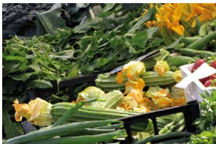
Vegetable diversity on sale at Campo de' Fiori market in Rome, Italy.

SBSTTA 14 launched the third edition of the Global Biodiversity Outlook (GBO). This publication, available from the CBD website, documents the world's failure to achieve the 2010 biodiversity target of reducing the rate of loss of biodiversity. This target was