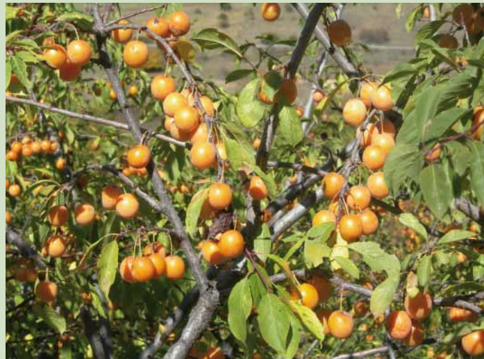
A healthy tree of Prunus divaricata (plum) growing in Armenia.

A second call will be launched at the end of 2010 (for more information see http://aegis.cgiar.org/about_aegis/latest_news/aegis_grant.html ).