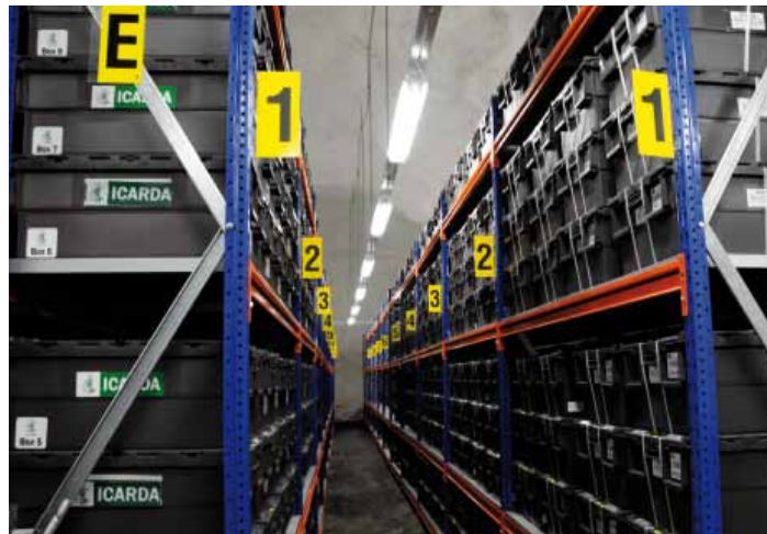
A view of the Svalbard storage rooms. Photo: Mari Tefre, Longyearbyen, Svalbard

Since the opening day, the collection of seed samples in the Seed Vault has doubled and in May 2010 the total holding stood at 526 000 samples originating from nearly every