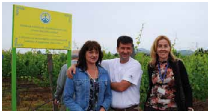
Top: The SEEDNet Vegetables WG on a field trip during the EUCARPIA Genetic Resources section meeting in Ljubljana, Slovenia in 2009. Bottom: Montenegro's PGR coordinators in front of their collection of autochthonous Vitis accessions.