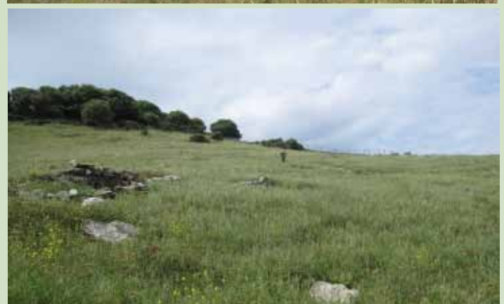
Images from the Avena collecting missions in Sicily and Andalusia. Top: Figure 1. Sicily, Avena insularis habitat. Bottom: Figure 2. Andalusia, Avena murphyi habitat.