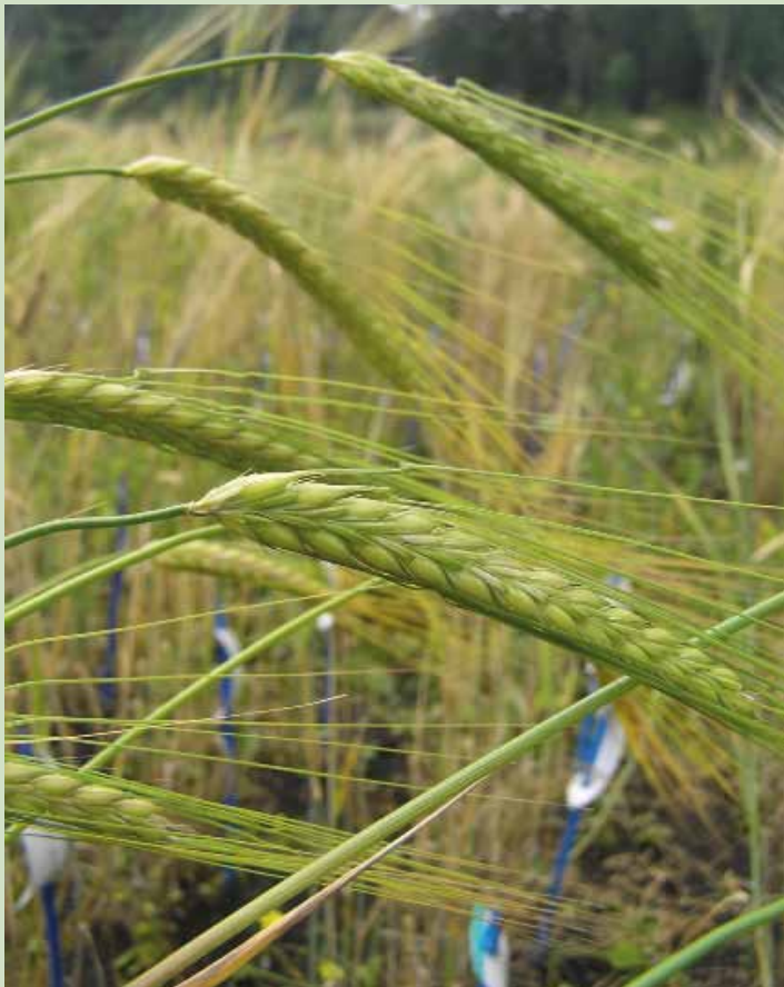
The Nordic barley landraces have shown excellent resistance against barley leaf spot diseases and are useful resources in modern breeding programmes.

One of the conclusions of the workshop was the decision to form a task force to produce concept notes on pre-breeding issues. Ten participants volunteered for this and a concept note on small grain cereals is now ready and publicly available on the ECPGR webpage at: www.ecpgr.cgiar.org/Networks/Cereals/PreBreeding_Concept_Note.pdf .