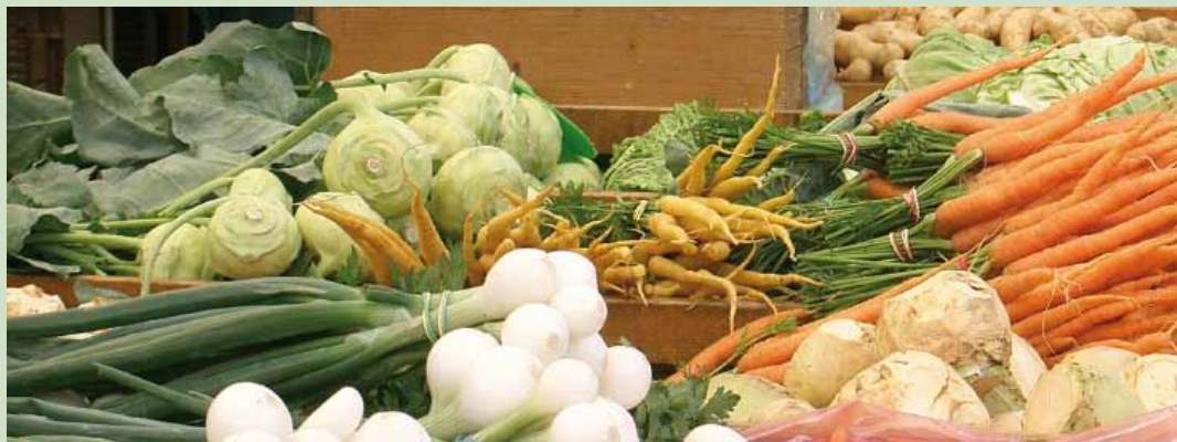
A selection of local roots and tubers on sale at the market in Ljubljana, Slovenia.

The report of the meeting is available online at: www.ecpgr.cgiar.org/Networks/Info_doc/info_doc.htm . Related presentations can be downloaded at: www.ecpgr.cgiar.org/Networks/Info_doc/Feb2010_Presentations.htm .