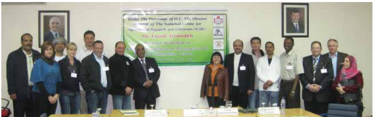
Participants and regional representatives at the AARINENA Regional workshop, Amman, Jordan.

The Regional workshop provided an opportunity for PGR specialists from across the Region to meet each other, exchange experiences and identify priorities for collaborative action. Further collaboration within AARINENA and cooperation with its international partners will be needed to implement common projects. The participants also expressed their wish to pursue closer linkages with other neighbouring Regions, such as Central Asia and Europe. The workshop took place in conjunction with the International Conference on Food Security and Climate Change in the Dry Areas. The full report is available from AARINENA's website ( www.aarinena.org ).