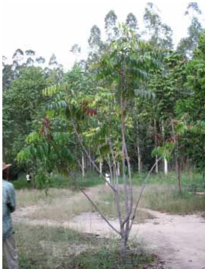
Many tree species contribute to local livelihoods, but genetic resources of most of them have not been characterized. Genomic advances have not yet been made relevant for species such as those in this arboretum in Brazzaville, Congo.

The conference was organized jointly by the International Union of Forest Research Organisations (IUFRO) Working Parties 2.04.01 on Population, Ecological and Conservation Genetics and 2.04.10 on Genomics in collaboration with Universiti Kebangsaan Malaysia, Forest Research Institute Malaysia (FRIM), Universiti Putra Malaysia and Biodiversity International.