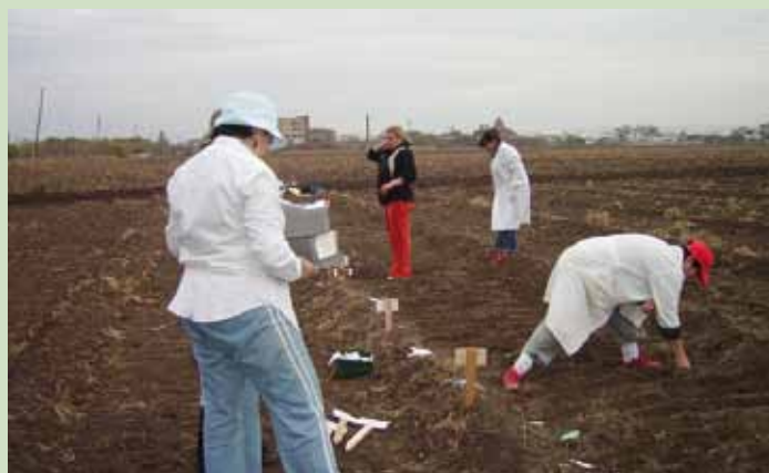
Sowing of threatened wheat and Aegilops accessions for regeneration at the Armenian State Agrarian University (Yerevan) in October 2009.

The first year's activity of a two-year project funded by the Global Crop Diversity Trust for the regeneration and safety-duplication of regionally prioritized crop collections was concluded in March 2010. The project, jointly prepared by the ECPGR Cereals Network and the Oil and Protein Crops Network, and submitted for funding through the ECPGR Secretariat, is aiming at carrying out regeneration and safety-duplication of over 5000 threatened accessions identified in ten European countries (Albania, Armenia, Azerbaijan, Belarus, Bulgaria, Georgia, Greece, Hungary, Israel and Portugal). The total grant is nearly US$130 000 and the ECPGR Secretariat is acting as the backstopping agent for the project. As a result of the first year of activities, the 12 partner institutions involved have successfully regenerated