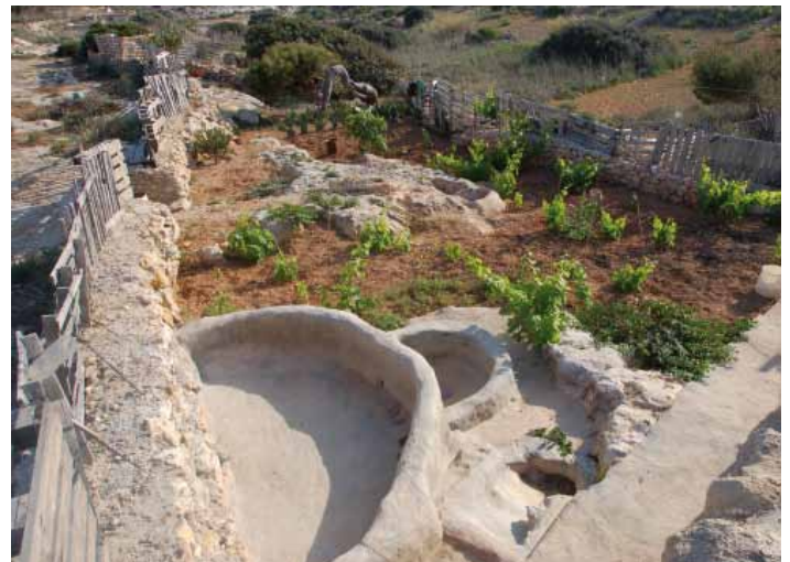
Vitis germplasm in Lampedusa during an INROF recovery mission to the small Sicilian islands off the Italian mainland.

to organic farmers’ needs. Maintenance and survey of traditional germplasm typical of the different regions, as well as its wild or semi-domesticated relatives, can be of strategic importance to ensure a useful genepool for breeding programmes specific for organic farming. Advances in conservation methods have generated new opportunities for genetic resources conservation and use. Both in vitro tissue culture and molecular biology have made available techniques that will greatly aid in the evaluation, collection and storage of germplasm. Seed storage has been the conventional method for plant germplasm conservation at low temperatures. However, some species (clonally propagated crops) can be maintained through field collections. Techniques such as in vitro culture and cryopreservation may represent an alternative for conservation of such species. For animal genetic resources the combined use of embryos and semen for cryogenic conservation of farm mammal genetic resources can be a valid alternative conservation method.