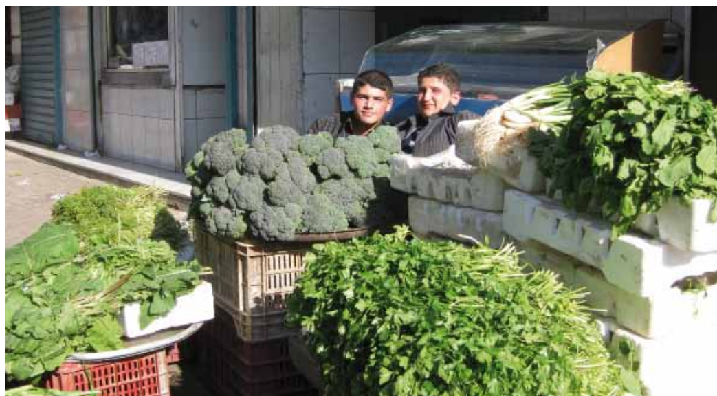
Diversity of green leafy vegetables, onions and brassicas sold by young street vendors in Amman, Jordan.

We invite you to participate in the online version of the Newsletter by sending your ideas, feedback and written contributions to Bioversity's Regional Office for Europe, by email, to bioversity-europe@cgiar.org . Please send all contributions for Issue 41 by 3 September 2010 .