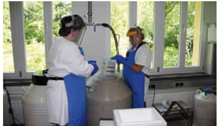
Taking cryo samples out of the tank.

The focus of the SLTB meeting was on "Application of Cryopreservation from Human Tissue Engineering to Plant Genebank Integration". Highlights of the Hannover meeting were presentations on basic research in human tissue engineering and deeper insights from molecular