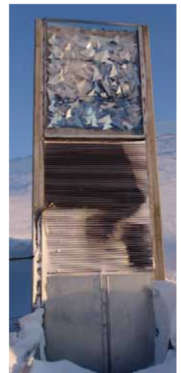
The entrance to the Svalbard Seed Vault.

For specific information about the current content in the Seed Vault and on how to make a deposit, visit the Seed Portal: www.nordgen.org/sgsv .