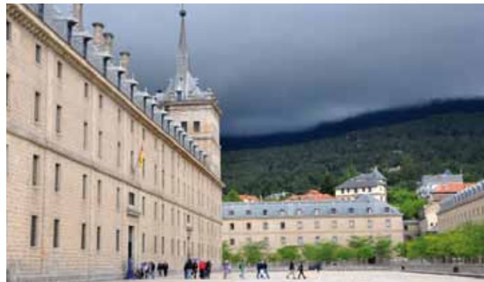
The Royal Monastery in San Lorenzo de El Escorial (Madrid) - an imposing architectural backdrop to the international conference venue, located nearby.

The conference, co-organized by the research partners in the Network of Excellence EVOLTREE